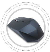
Lenovo® Wireless Mouse N50