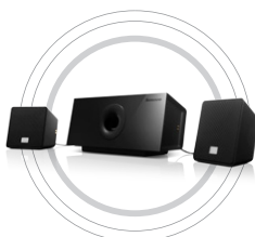
Lenovo® Speaker M1730