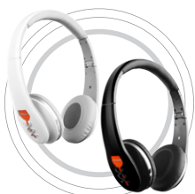
Lenovo® Wireless Headset W870