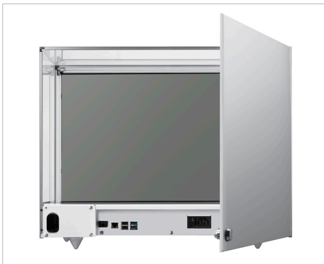
Figure 1. Samsung NL22B: Rear view

An optional touchscreen feature provides an engaging, enhanced customer experience that works with any pointing device or with the touch of a finger.