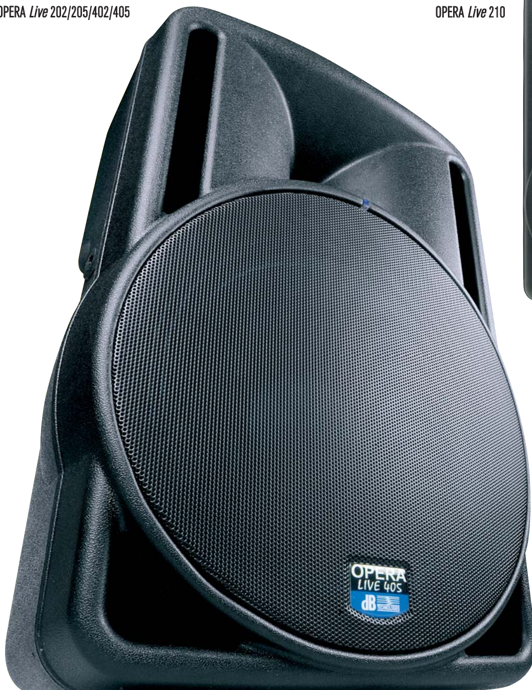
OPERA Live 210