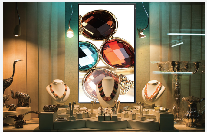
Figure 1. Commercial applications can leverage QMD Series clarity and operational capabilities.

Samsung QMD Series SMART Signage features a new design and delivers 3,840 x 2,160 resolution, multi-format PIP support, DP 1.2 support, set-back box (SBB) support, portrait or landscape orientation and reliable 16/7 operation for amazing flexibility and picture clarity in commercial settings. For example, retail stores can leverage Samsung QMD Series with UHD to improve their brand image and showcase products in sharp detail, while corporations and arena or museum security centers can use the high-resolution displays to enhance security with stable and vivid content playback.