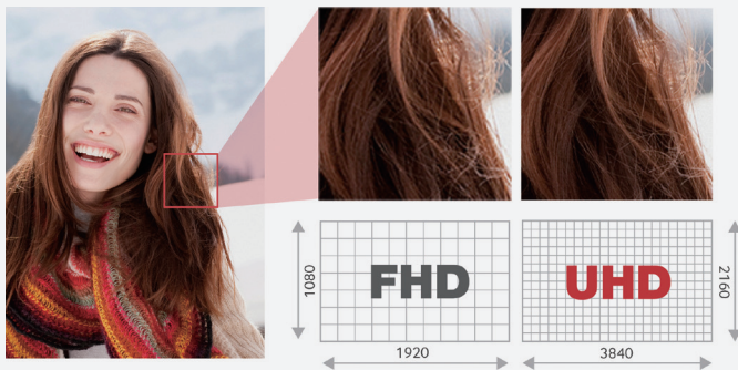
Figure 2. UHD high pixel density provides accurate detail representation.

QMD Series delivers four times the FHD resolution on the same screen area, resulting in the most accurate recreation of details possible. Text that displays on QMD Series in UHD is super-crisp due to its high pixel density. High-detail visuals, such as photos and videos, are visible with the smallest details for a hyper-realistic and immersive visual experience.