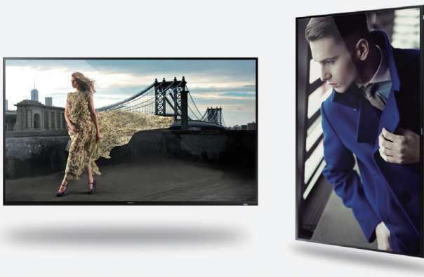
Figure 4. Pivot mode to fit the aesthetic setting while delivering dynamic content.

To meet the demands of traditional commercial environments, digital signage is often installed in portrait mode. Thus, it is critical that the digital signage supports portrait installation to fit to the aesthetics of the setting while still delivering the dynamic qualities of digital signage. QMD Series offers pivot mode that allows them to be installed in either landscape or portrait orientation to suit the environment's needs.