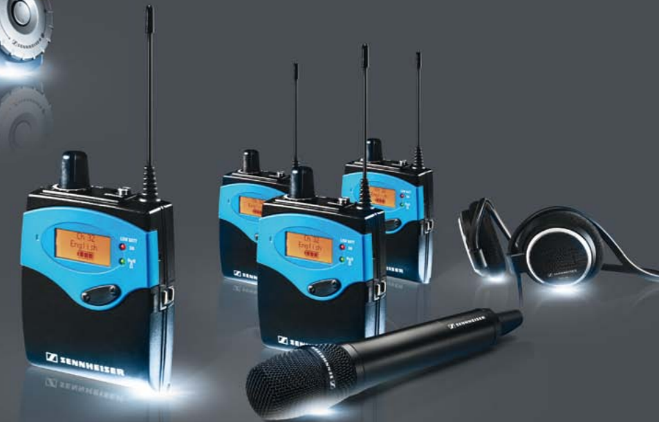
tourguide EK 1039