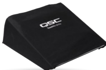
TouchMix-30 Pro Dust Cover