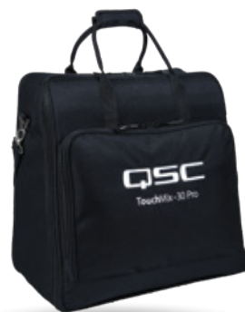
TouchMix-30 Pro Tote