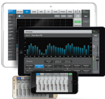
TouchMix Control App for iOS® and Android™ devices

In instances where Wi-Fi control is either not reliable or not desired, the elegant touch-and-turn interface of TouchMix allows for tactile control over fader and mixer parameters while also providing a reliable fixed hardware connection to vital mixer functions.