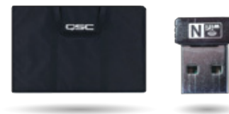
Included carry-case and Wi-Fi dongle

The TouchMix-16 offers a full suite of professional, results-oriented features and incredible sound quality. Its 22 mixing channels (16 mic/line / 2 stereo line / stereo USB inputs) make it the perfect choice for those who don't need the higher channel count of the flagship TouchMix-30 Pro.