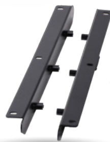
Rack-Mounting Kit for TouchMix-30 Pro